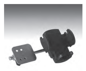
Pivoting Cell Phone Holder

Specifications subject to change without notice.