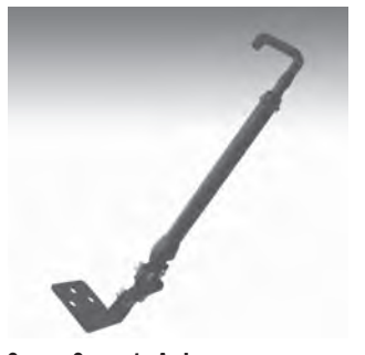
Screen Support - Acd

The Brace Kit attaches to the stand providing additional support. It can be adjusted in length and mounts to flat, vertical or angled surfaces.