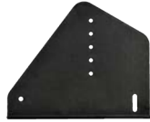
Stiffener Bracket 425-3773