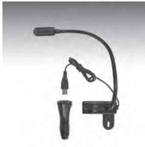
USB Light 425-2490

The Brace Kit attaches to the stand providing additional support. It can be adjusted in length and mounts to flat, vertical or angled surfaces.