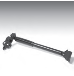
Brace Kit 425-5238

Specifications subject to change without notice.