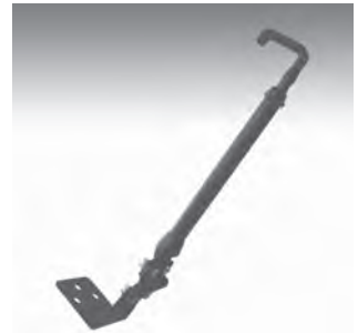
Screen Support - Acd 425-5999

12" flexible wand with blue LED's and rheostat to adjust brightness. Three foot power cord plugs into cigarette lighter.