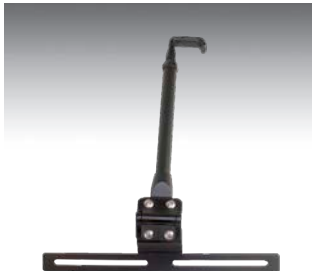
SCREEN SUPPORT - A-MOD

Computer securing system uses Kensington locking system. Fasten security cable to permanent structure in vehicle.