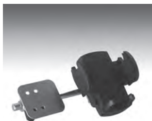
Pivoting Cell Phone Holder

Specifications subject to change without notice.