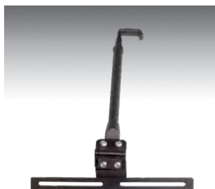
Screen Support - A-Mod

Computer securing system uses Kensington locking system. Fasten security cable to permanent structure in vehicle.