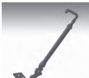
Screen Support - Acd

The Brace Kit attaches to the stand providing additional support. It can be adjusted in length and mounts to flat, vertical or angled surfaces.