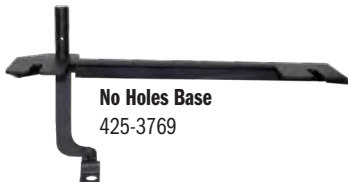
No Holes Base