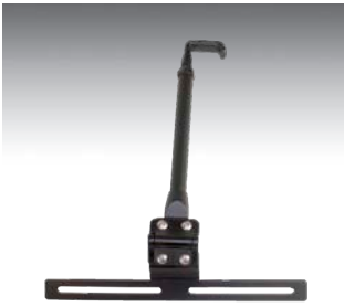
SCREEN SUPPORT - A-MOD

Computer securing system uses Kensington locking system. Fasten security cable to permanent structure in vehicle.