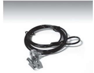
Kensington® Masterlock® 425-1317

12" flexible wand with blue LED's and rheostat to adjust brightness. Three foot power cord plugs into cigarette lighter.