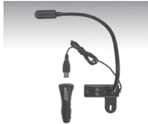
USB Light 425-2490

Allows you to tilt your phone independent of the desktop angle. Mounts to side of 10" x 12" Desktop.