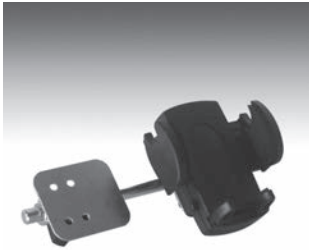
Pivoting Cell Phone Holder 425-5299

Specifications subject to change without notice.