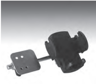
Pivoting Cell Phone Holder

Specifications subject to change without notice.