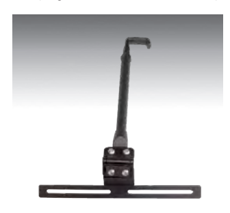
Screen Support - A-Mod

Computer securing system uses Kensington locking system. Fasten security cable to permanent structure in whice