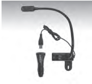
USB Light 425-2490

Allows you to tilt your phone independent of the desktop angle. Mounts to side of 10" x 12" Desktop.