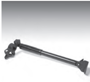
Brace Kit 425-5238

The Screen Support is designed to keep your screen in place while you use your computer. It attaches directly to the A-MOD Desktop and adjusts in height and tilt angle.