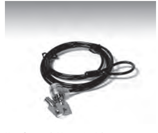
Kensington® Masterlock® 425-1317

12" flexible wand with blue LED's and rheostat to adjust brightness. Three foot power cord plugs into cigarette lighter.