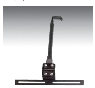
Screen Support - A-Mod

Computer securing system uses Kensington locking system. Fasten security cable to permanent structure in vehicle