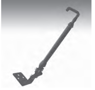
Screen Support - Acd

The Brace Kit attaches to the stand providing additional support. It can be adjusted in length and mounts to flat, vertical or angled surfaces.