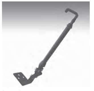
Screen Support - Acd

The Brace Kit attaches to the stand providing additional support. It can be adjusted in length and mounts to flat, vertical or angled surfaces.