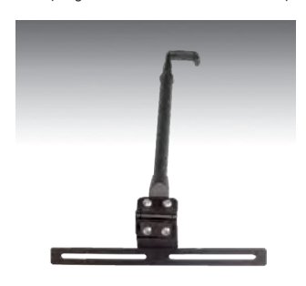
Screen Support - A-Mod

Computer securing system uses Kensington locking system. Fasten security cable to permanent structure in vehicle