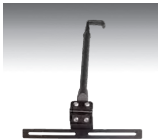
Screen Support - A-Mod

Computer securing system uses Kensington locking system. Fasten security cable to permanent structure in vehicle.