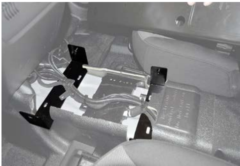
Using provided hardware (mounting studs) secure Front Mount Bracket and Rear Mount Bracket. Finger tighten. Replace OEM cover plate.