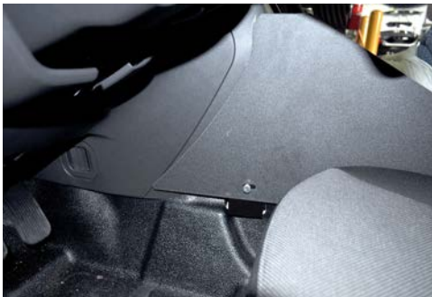
Secure at the front/dash area from the outside of the console using provided 5/16" x 5/8" (long) button head allen bolts/washers.