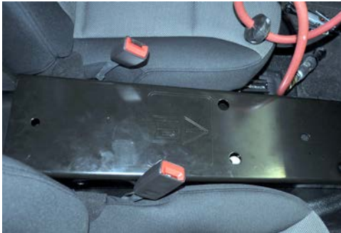
Remove (6) 8mm bolts to remove OEM cover plate.

*Not compatible with Ford Police Interceptors ordered with Interior Upgrade Package.