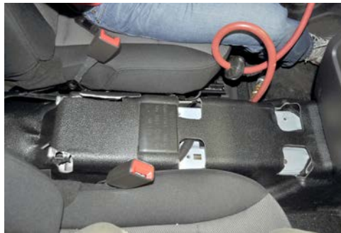
Temporarily remove OEM cover plate and set aside.