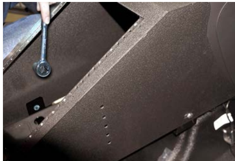
Push 1/4" - 20 x 3/4" carriage bolt through rear area of outside of console and through bracket. Secure at the rear area from the inside of the console using provided 1/4" - 20 flange nut.