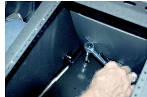
Using 8mm deep well socket – completely tighten the OEM cover plate mount points which will also completely tighten the Front/ Rear Mount Brackets.

If you have questions or need further assistance please call Technical Support: 1.877.455.6886