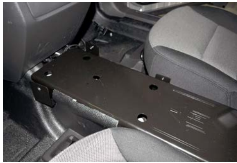
When OEM cover plate is in position, tighten down bracket location with provided nuts onto previously install studs. Reuse OEM bolts in rear side locations.