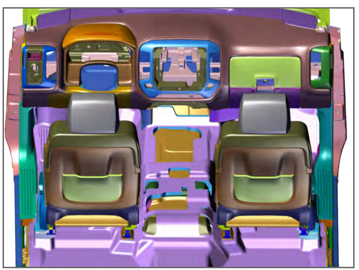
1. Remove 20 section of 40/20/40 Seat, if necessary.