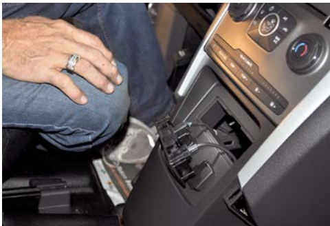
Disconnect (2) 12v outlets and USB/Line-in plate. Use small flat blade screw driver to remove OEM 12v outlets and USB/Line-in plate. Set aside for remounting USB in Jotto Desk Contour Console