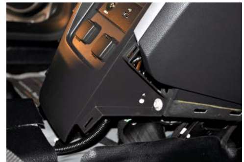
Remove (2) OEM Trim Panels from Side of Dash