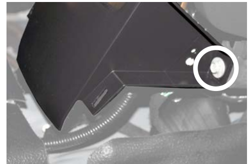
Remove Middle/Lower Dash Structure – by removing 2 (10 mm) bolts/screws.