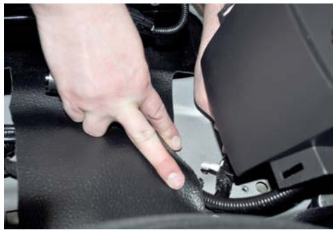
At dash of OEM cover plate – remove tab that secures a cable to OEM cover plate