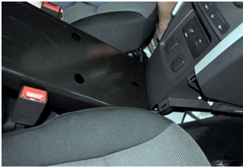
Remove all (6) 8mm bolts that secure OEM cover plate to vehicle. OEM cover plate will not be used/needed.