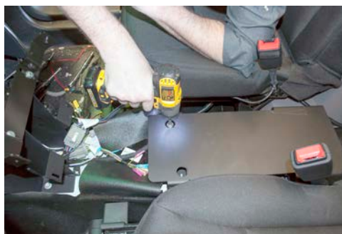
Place provided Cover Plate over Rear Mount Bracket and tighten using provided flange nuts through hole openings.