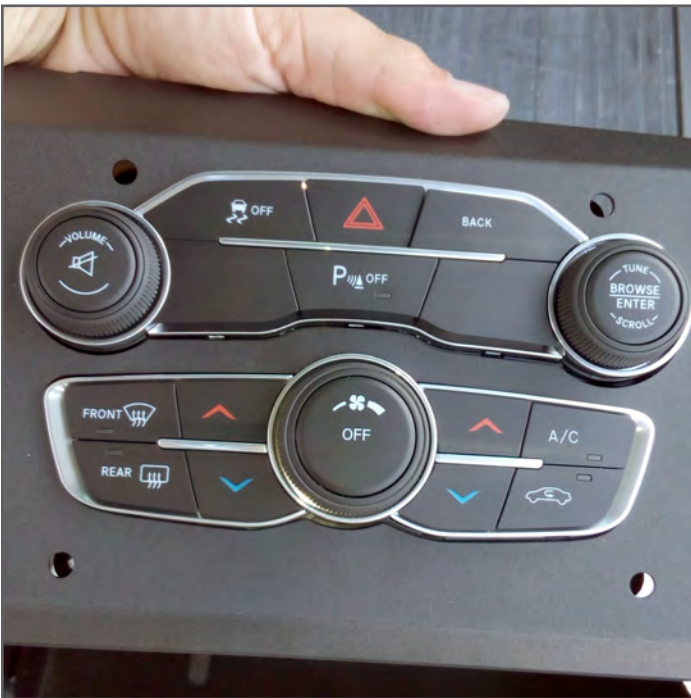
7. Slide module into provided cutout by aligning holes with studs on the backside of the console. Install provided nylock nuts to hold module into place.