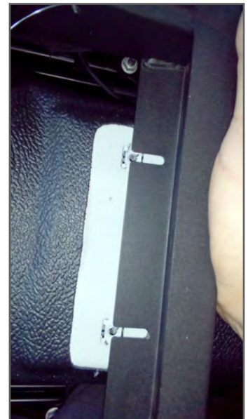
8. Position console into vehicle reconnecting electrical plugs.