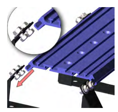
Lightly secure (8) of the 5/16-18 bolts, washers, and nuts to the Floor Plate Brackets. Slide the Floor Plate in from the rear, aligning the bolts with the side grooves on the Floor Plate side.