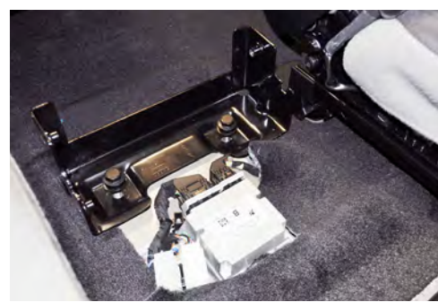
Remove (2) OEM mounting brackets.