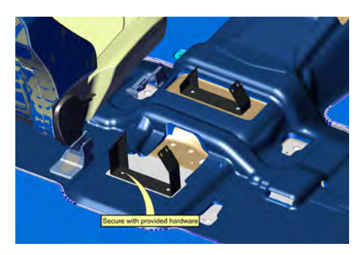
Place front and rear Floor Plate Brackets over hole locations. Secure with provided bolts or OEM hardware.