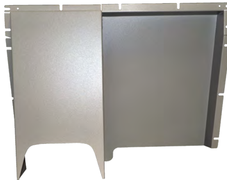
Bi-Directional Recessed Housing