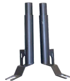
(2) B Pillar Bracket