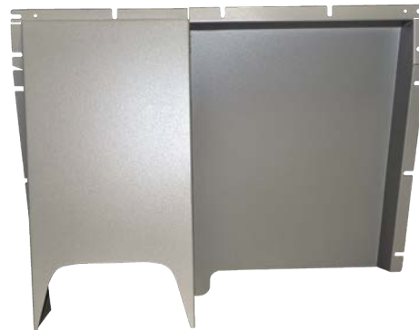
Bi-Directional Recessed Housing