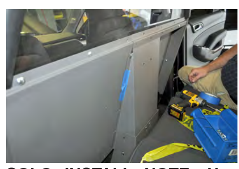
SOLO INSTALL NOTE: Use masking tape over carriage bolts to hold bolt in place while attaching flange nuts from front side of partition.