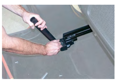
Place Foot Mount Bracket onto seat rail. Replace OEM bolt at this time. Snap cover back onto seat rail. Repeat all previous steps for other side.