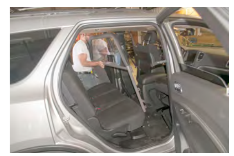
Install Partition frame into vehicle through DS door and position onto mounting feet.