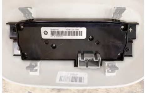
Detach the Rear AC Control Box from component housing. Then reconnect and position back into place.