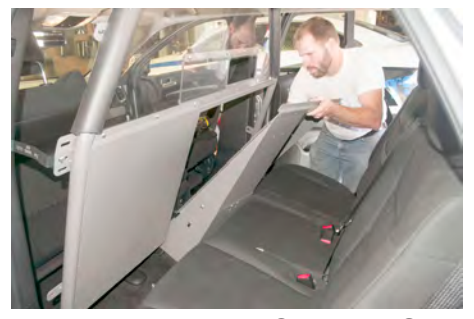
Place BDRH with Center HSEP into vehicle. Attach BDRH to Partition Frame using provided carriage bolts and flange nuts. Push carriage bolts in from prisoner side of partition. Tighten all bolts/nuts.