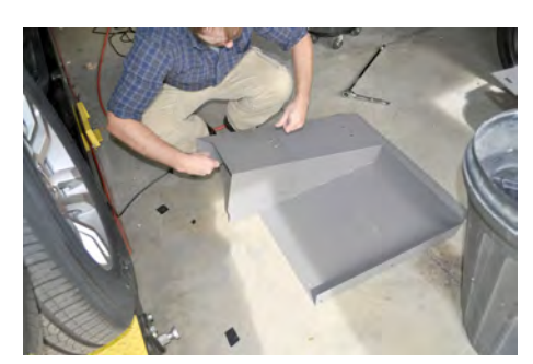
Loosely attach Center HSEP onto BDRH outside of vehicle using (6) carriage bolts and flange nuts.