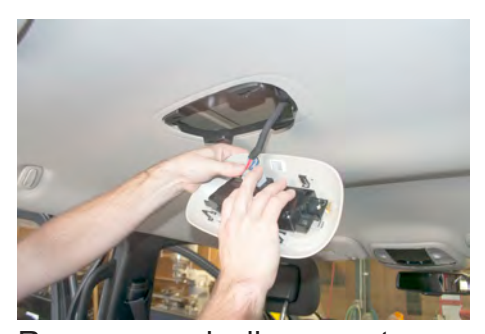
Remove and disconnect rear controls from headliner if vehicle has them.