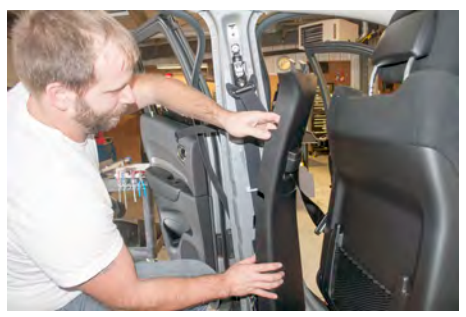
Using 9/32 socket remove exposed screw from Upper B pillar trim. Remove Upper B pillar trim.