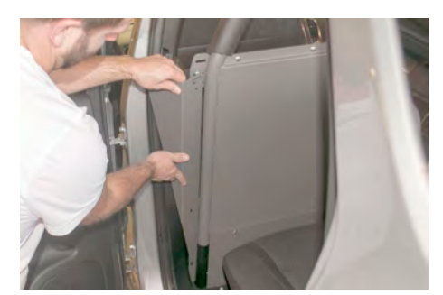
Install Lower Steel Wing from <u>prisoner</u> side using (3) carriage bolts and flange nuts. Repeat on other side.