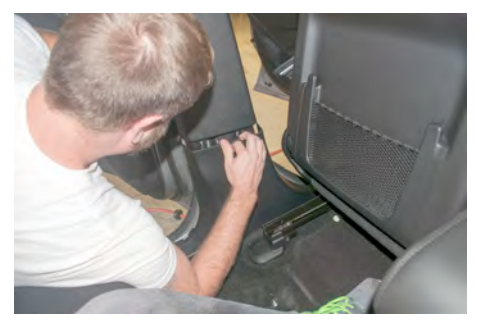
Pop plastic clips and remove lower B pillar.