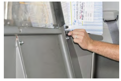
Install black caps on all flange nuts.

If you have questions or need further assistance please call Technical Support: 1.877.455.6886