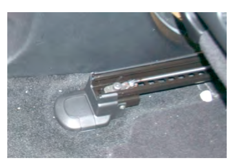
Move seats completely forward. Use a small flat head screw driver to pry cover off of seat bolt. Remove the rear/outer OEM 18mm seat bolt.