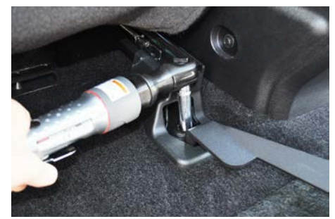
Reposition mounting plate on top of rear seat rails of front seats and tighten all OEM seat bolts and use provided hardware for AVK locations.