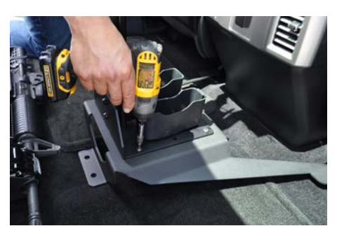
Position assembled backbone onto GR6 mounting plate.

Secure to plate using provided (4) button head cap screws.