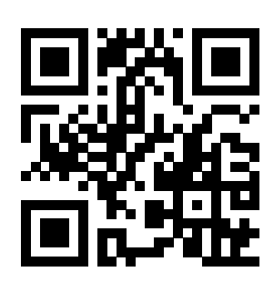
Install AVK fasteners, see other side for AVK install instruction, or watch the video here.