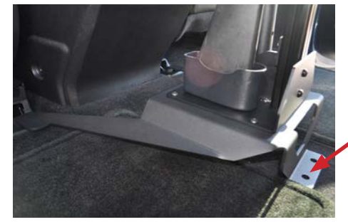
Slide GR6 mounting plate on top of inside seat rails of front seats. Mark hole location for rear of mounting plate for AVK install. Remove mounting plate and set aside.