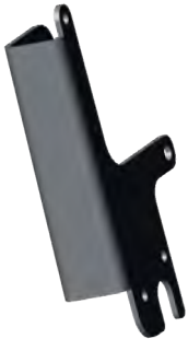
D/S Side Mount Bracket