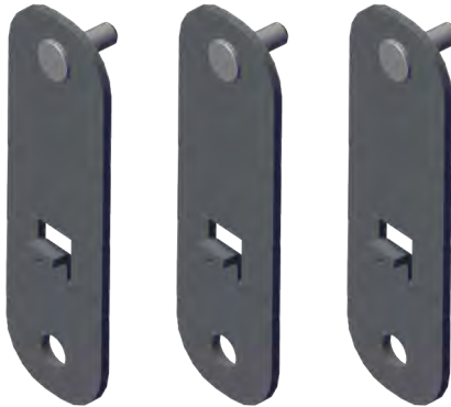
Lower Mount Brackets