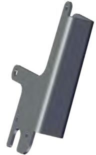
P/S Side Mount Bracket