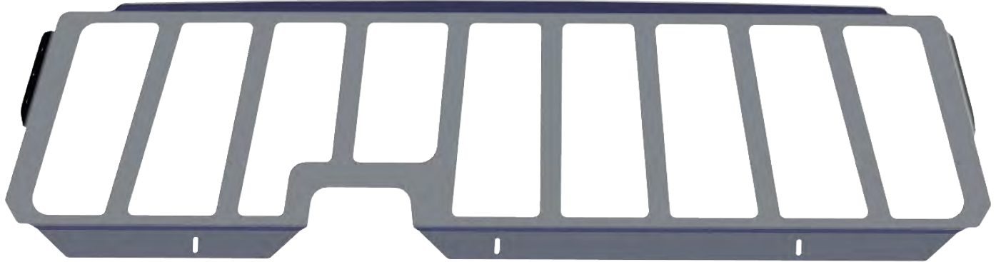
Rear Window Armor