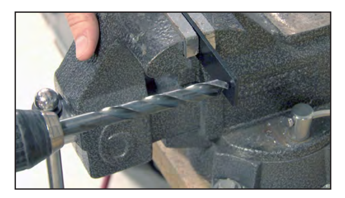
1. Drill out existing hole to 1/2" or drill new hole per installation instructions.

AVK Installation video can be viewed at: http://jottopublicsafety.gojotto.com/additional-categories/downloads.html