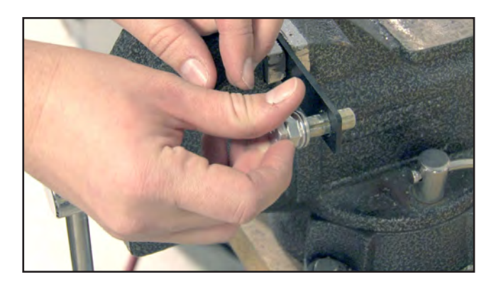
Place into 1/2" drilled hole.