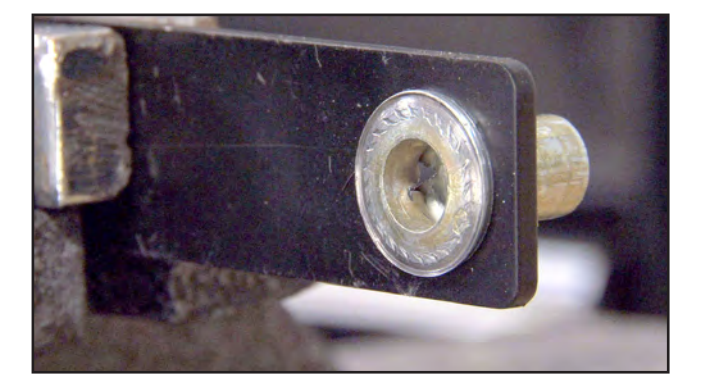
7. This will allow the AVK Fastener to secure onto the backside of the metal.