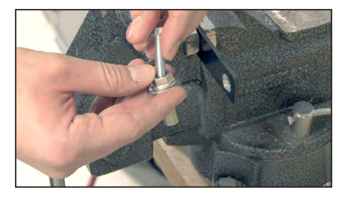
2. Place 5/16-18 \times 1.5 " long bolt through the 3/8" flange nut and hand thread bolt into the AVK Fastener.