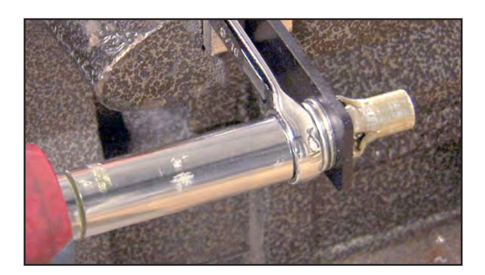
5. Apply pressure on the flange nut, pressing AVK Fastener into hole.